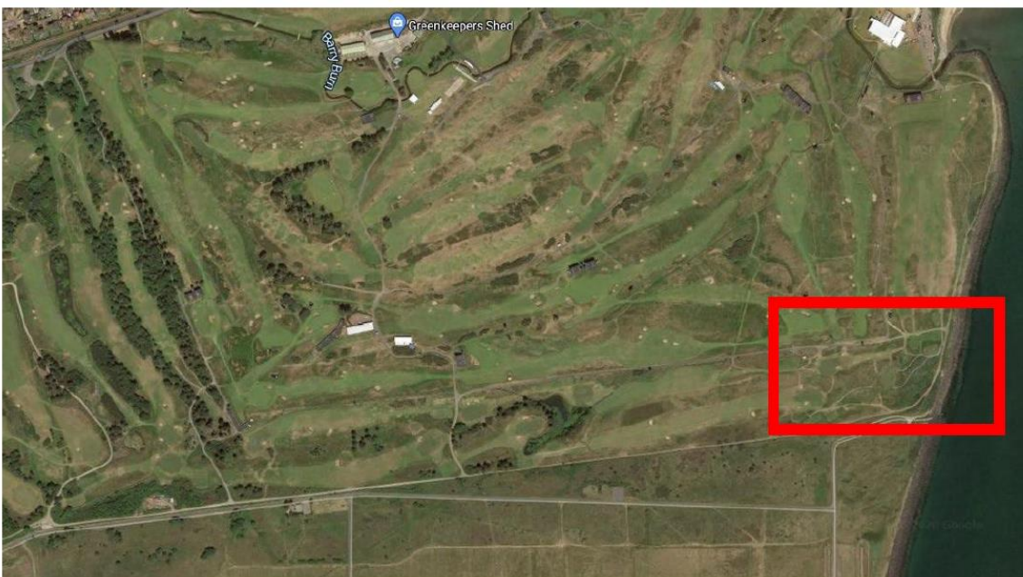
Fig 2 – Landfall works area located at Carnoustie Barry Golf Links.

Works continue at the export cable landfall site. Installation of three export cable ducts is now complete. Cement bound sand and final backfill operations have been completed. Placement of the top and bottom layers of rock revetment will commence this week with Pile extraction operations scheduled to commence next week. The landfall works area is shown below in Fig 2.