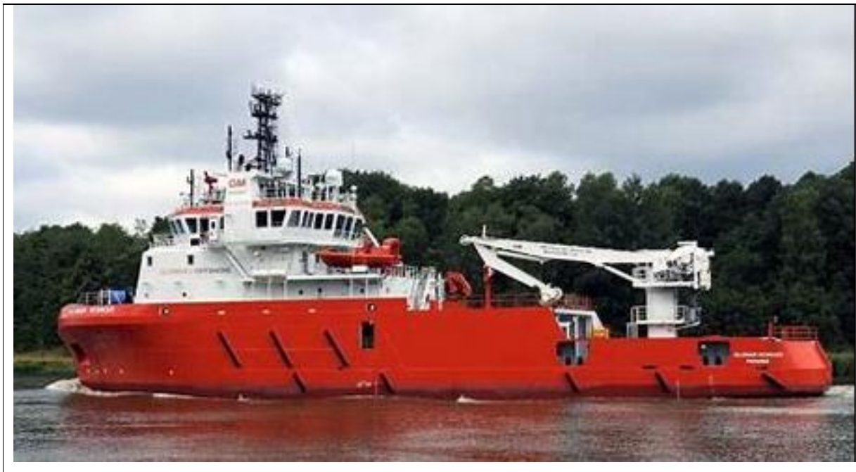
Table 3 – Survey Vessel Glomar Worker.