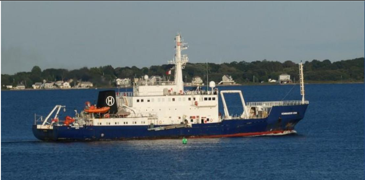
Table 2 – Survey Vessel Kommandor Iona