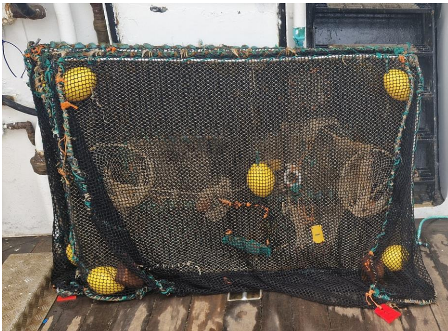
Fig 2 – Fish trap.