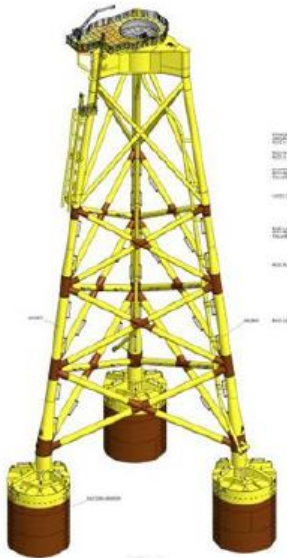
Fig 2 – WTG foundation structure

An example of a wind turbine generator foundation and suction caisson is shown below in figs 2 & 3