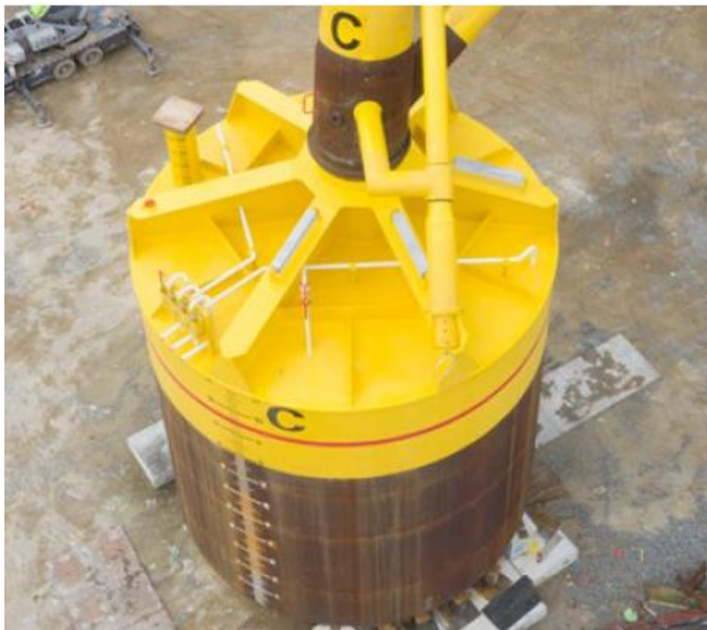
Fig 3 – Foundation caisson