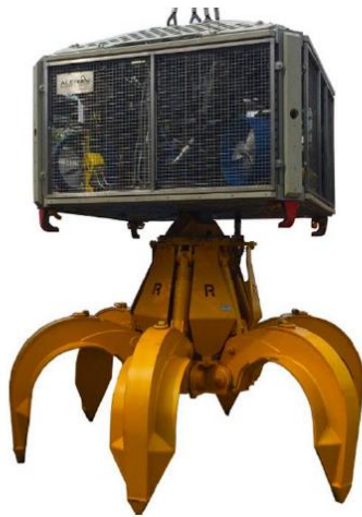
Fig 2 – ROV with integrated grab tool.

A replacement boulder clearance vessel Siem Dorado is expected to arrive on site on the 17 th of November 2021 to recommence boulder clearance and relocation operations. Further details of Siem Dorado are shown below