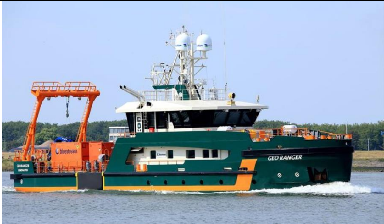
Table 2 – Survey Vessel Geo Ranger.