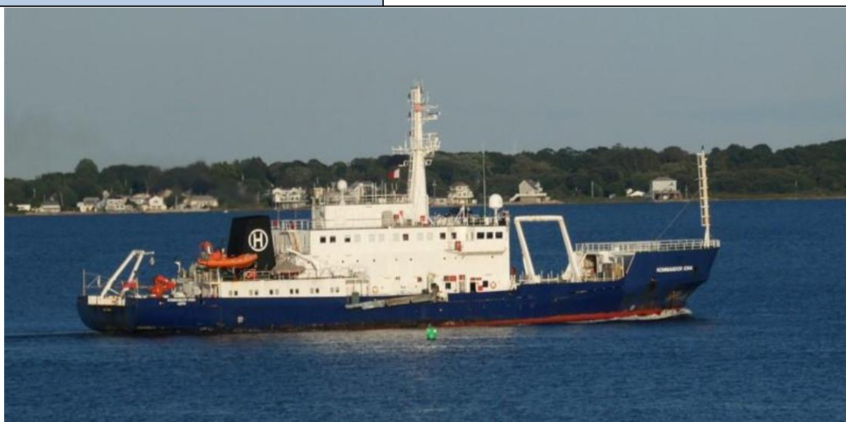
Table 2 – Survey Vessel Kommandor Iona