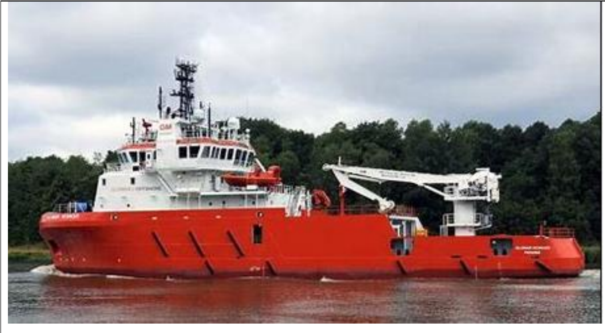
Table 3 – Survey Vessel Glomar Worker.