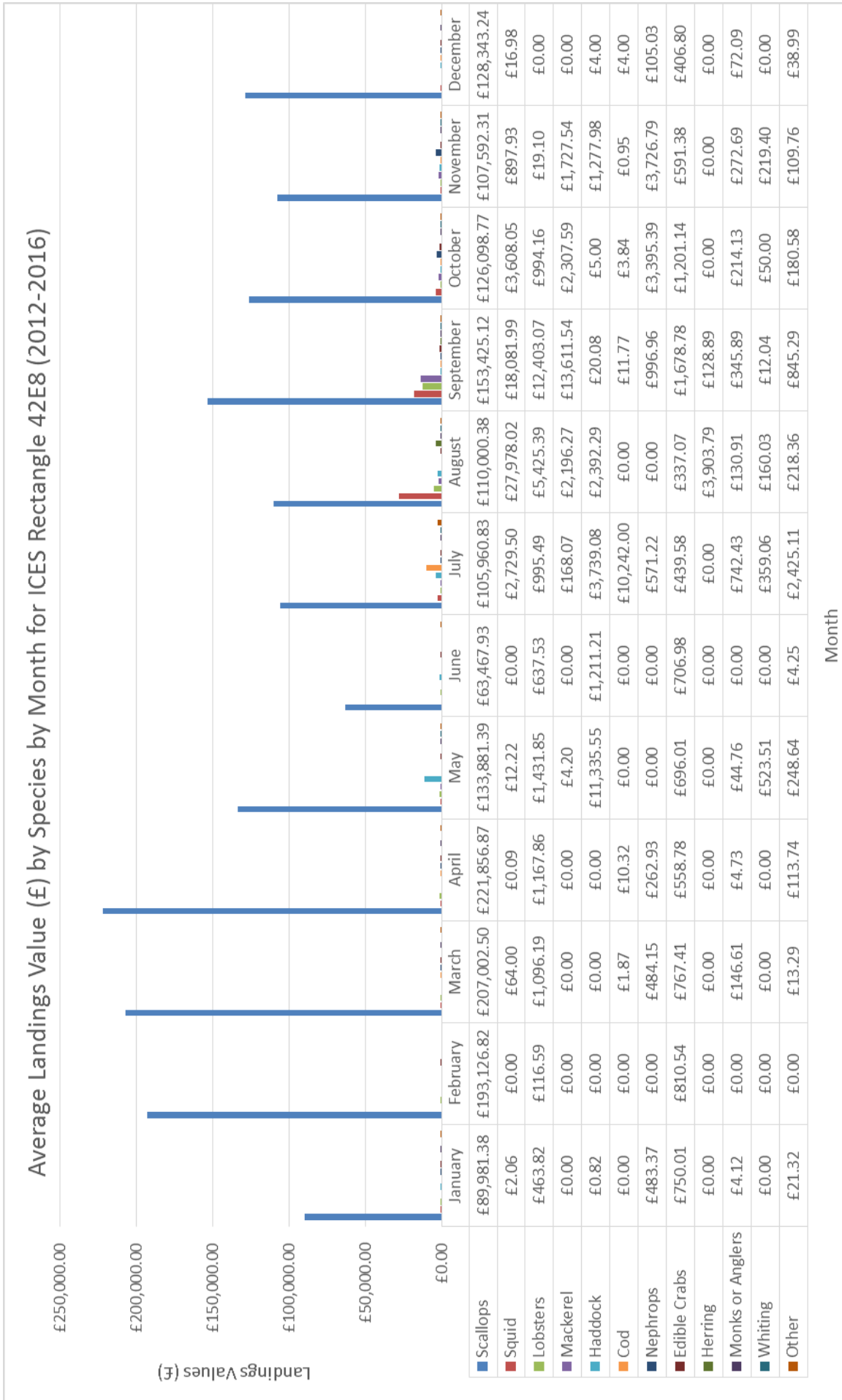
Plate 11.1 Average Landings Value (£) by species and month in ICES Rectangle 42E8 (2012-2016) (Source: MMO, 2018)