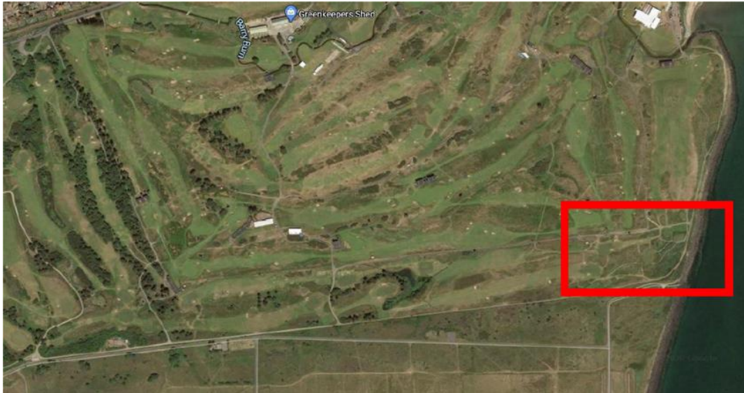
Fig 1 – Carnoustie cable landfall site.