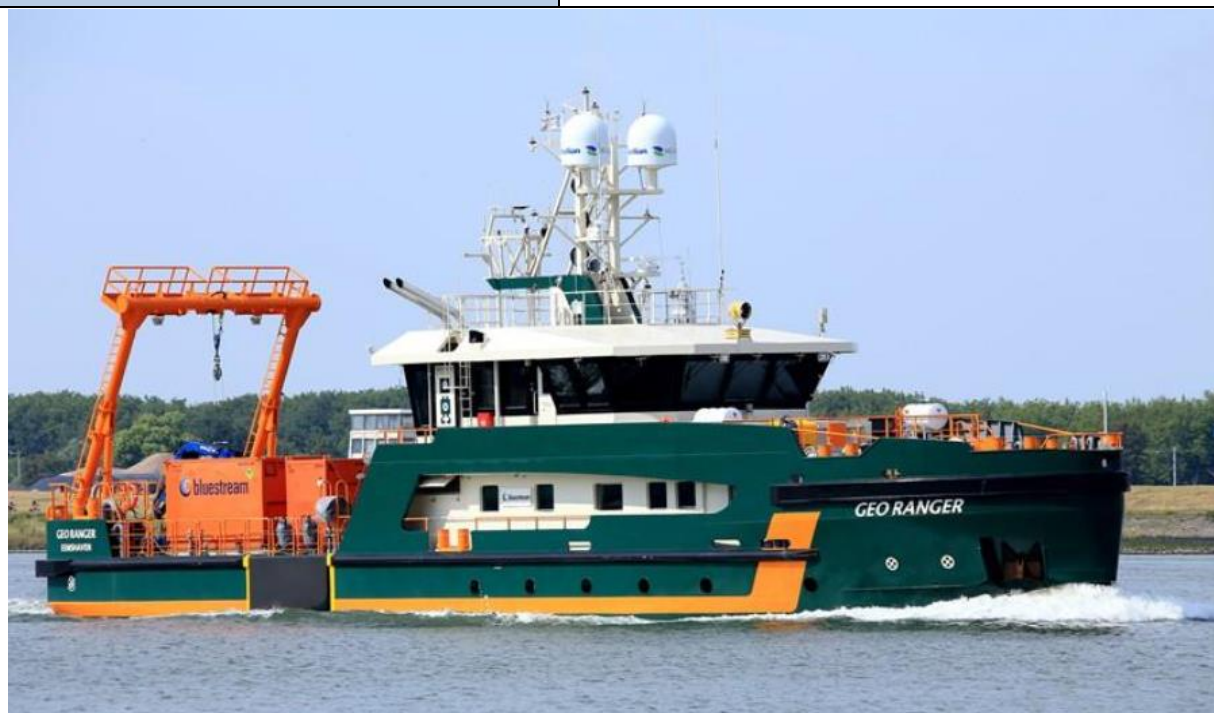
Table 2 – Survey Vessel Geo Ranger.