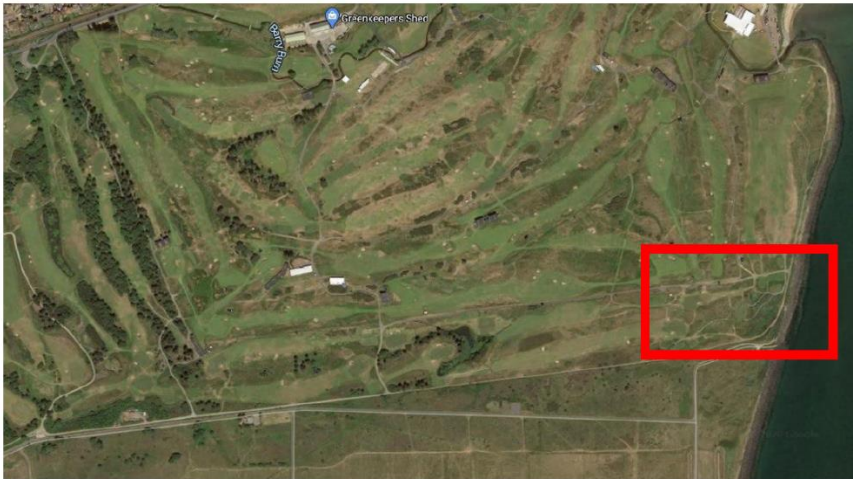
Fig 1 – Inter-tidal zone