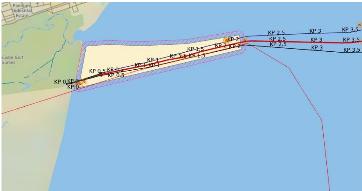
Fig 2 – Survey area.