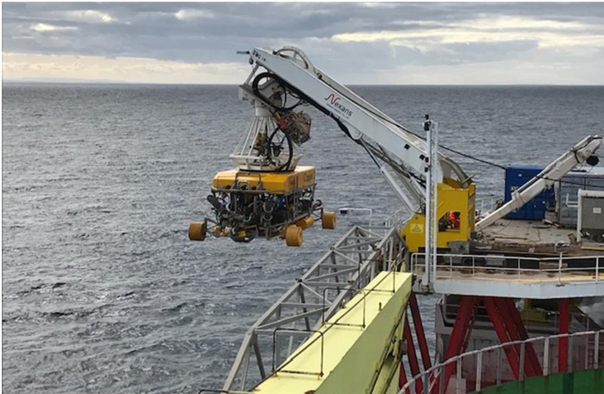
Fig 3 – Capjet trenching tool deployment.