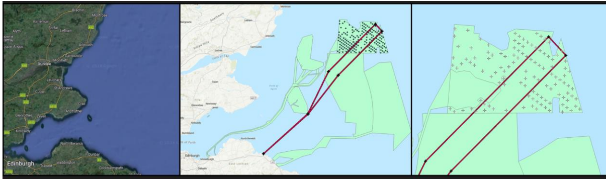
Fig 1 – ECOWings area of operation.