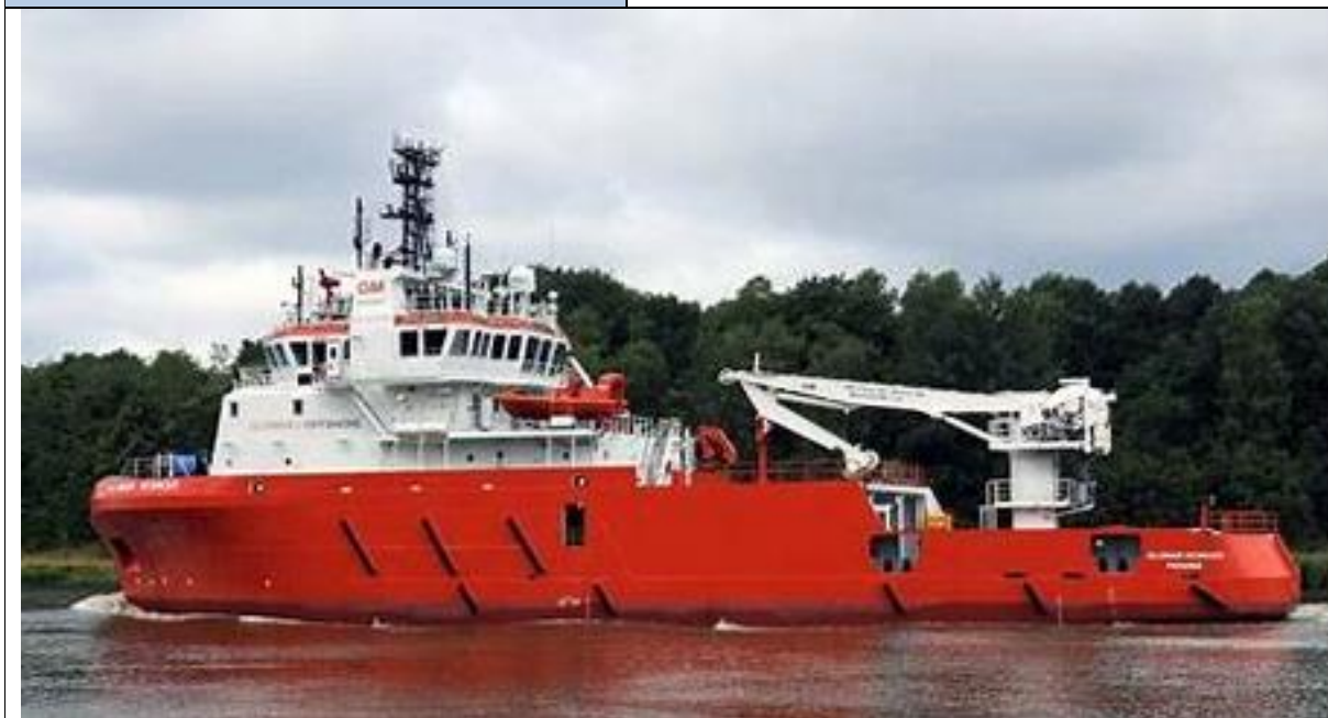
Table 3 – Survey Vessel Glomar Worker.