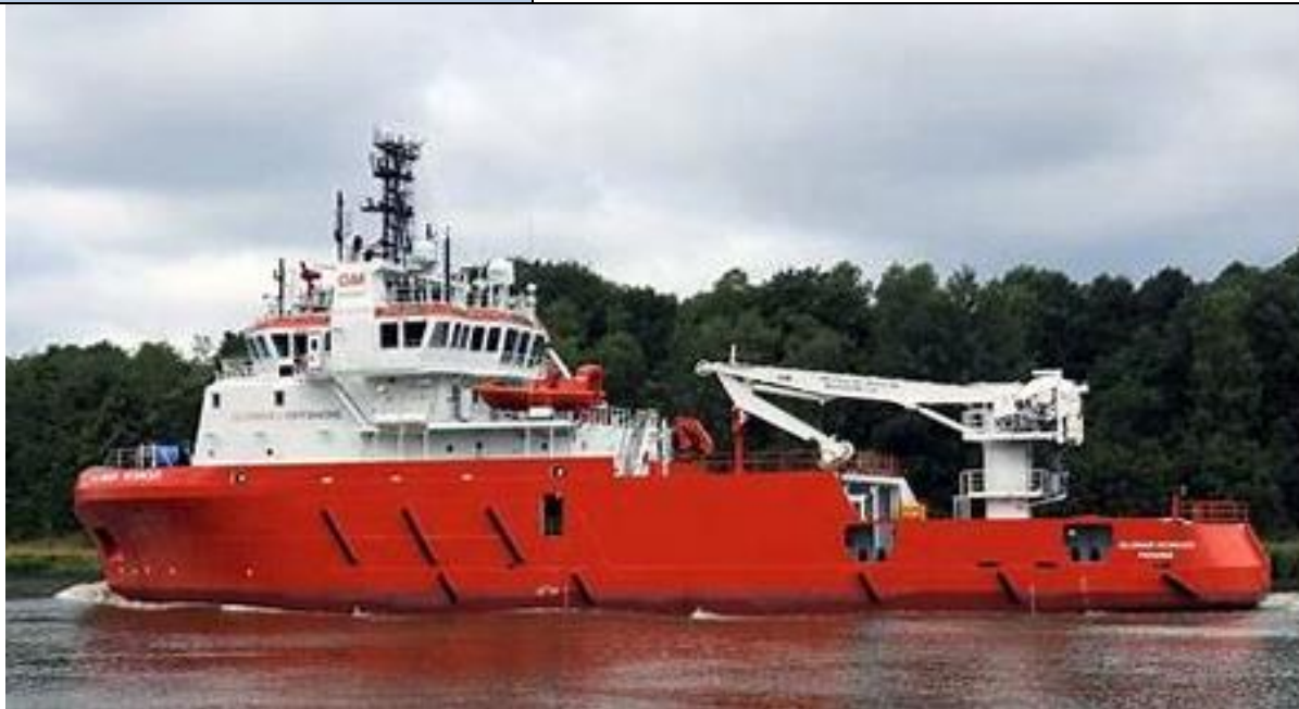
Table 3 – Survey Vessel Glomar Worker.