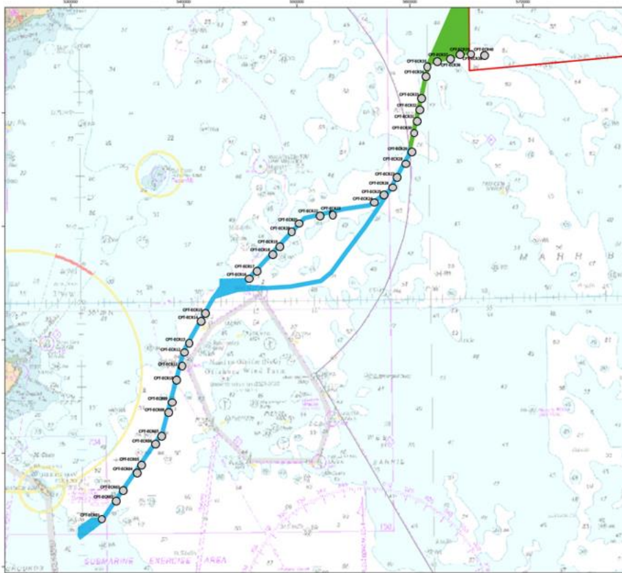
Fig 1 – Export cable corridor survey locations.